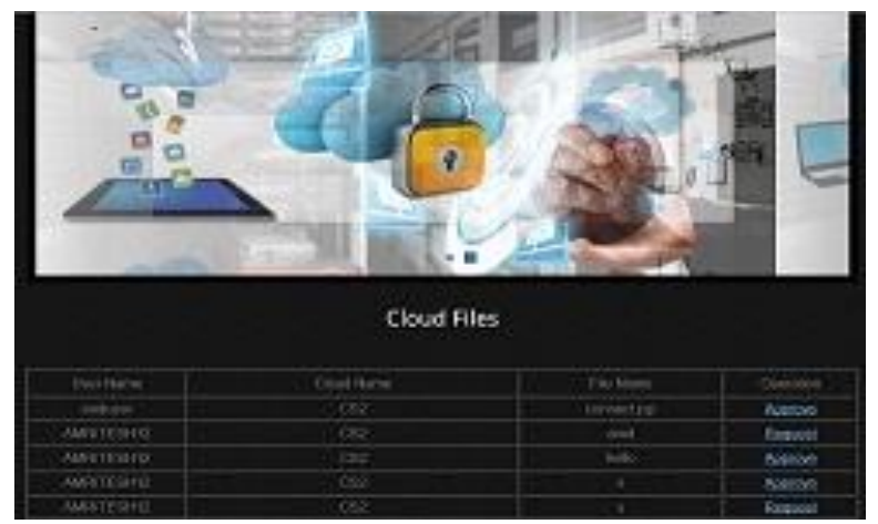
Figure 5: Cloud server