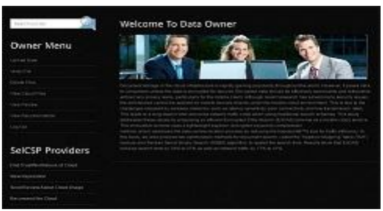
Figure 3: Data owner