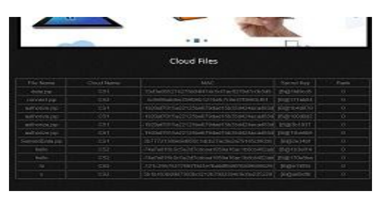
Figure 6: Third party arbitrator

These modules have many properties and have the authentication privilege. It can also verify the file while encryption and the information will be sent to the data owner. The third party auditor is one who is having the capabilities if doingthe cloud operations on user's request. Third party auditor is also acloud server which is connected with remaining all distributed cloudservers so that TPA can able to verify the user files in the cloudeither any malfunctioning or misbehaving server is corrupting theusers data by proving the challenge which contains size of the fileand token keys of the file to the distributed cloud servers. TPAstores the user's file related tokens and encrypted data and comparesthe received challenge results from different servers if both are samethen there is no malfunctioning in any server if any one server givesnot equal results then it we can easily identify that is themisbehaving server malfunctioning is occurred in that particular server.