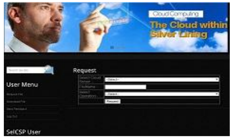
Figure 4:End user

It includes the user registration login details. It is used to help the client to search the file using the multiple key words concept and get the accurate result list based on the user query. The user is going to select the required file and register the user details and get activation code in mail email before enter the activation code. It also can view the file but cannot download until it won't put the activation code. And can also view the files.