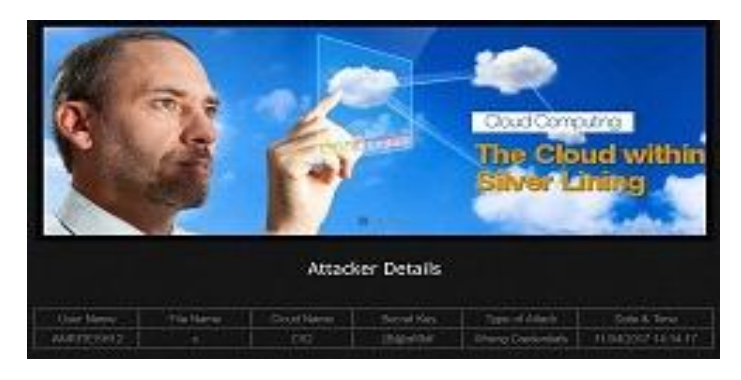
Figure 7: Attackers

This module[9][10] have developed in order to check the security level of the application, It will try to get the information from the cloud using fake id's and password, It also tries to make some kind of changes in the database. If this module will fail to change the document then process of login will be block for this module again it have to take permission from the data owner to start the proceedings as much wrong efforts will done that many times it will be blocked if the data owner can't able to permit the module it will not be able to process further in any kind of the activities. The data which have been changed this module can be retrieved by the cloud server